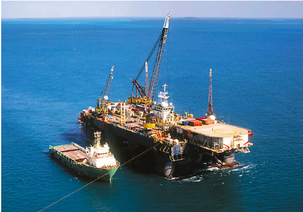
Typical anchored laybarge (above) and pipe supply vessel.