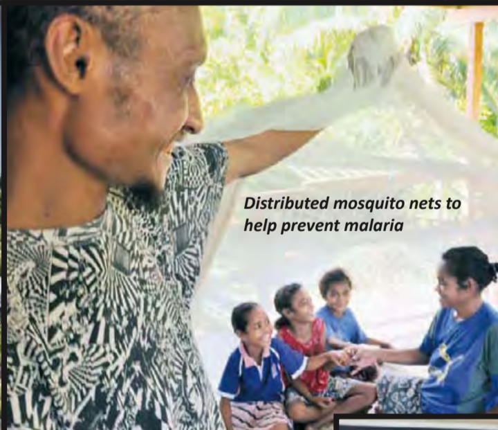
Distributed mosquito nets to help prevent malaria