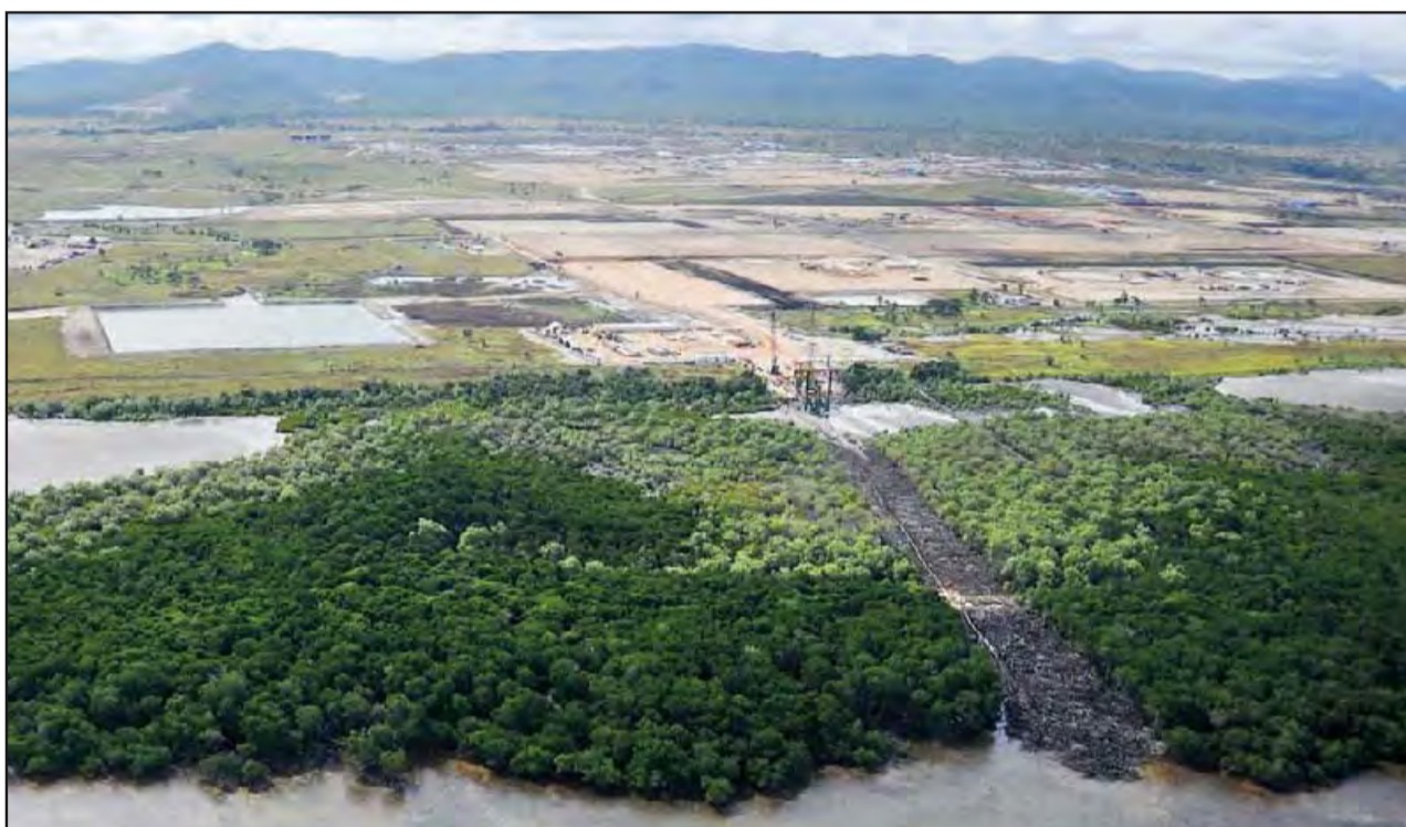
A Site to Behold This scenic view of the plant and jetty site, taken July 2011, gives an overall view of where we've been and where we're going.