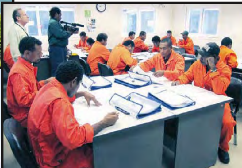
Employed more than 2,400 PNG nationals, mainly from local communities, and delivered 350,000 man-hours of training.