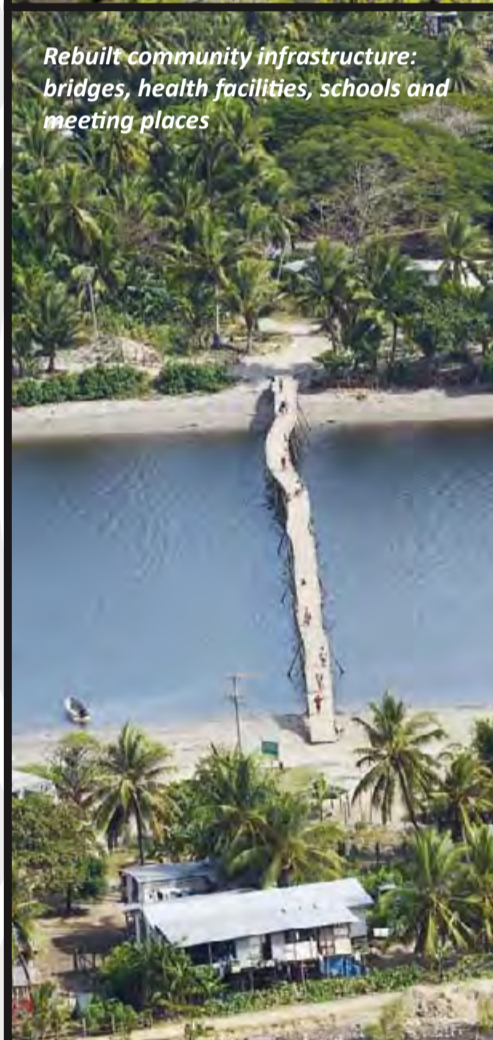
Rebuilt community infrastructure: bridges, health facilities, schools and meeting places