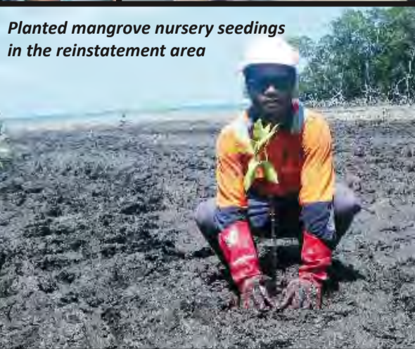
Planted mangrove nursery seedlings in the reinstatement area