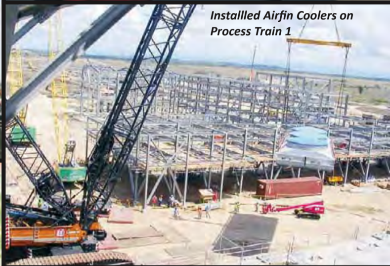
Installed Airfin Coolers on Process Train 1