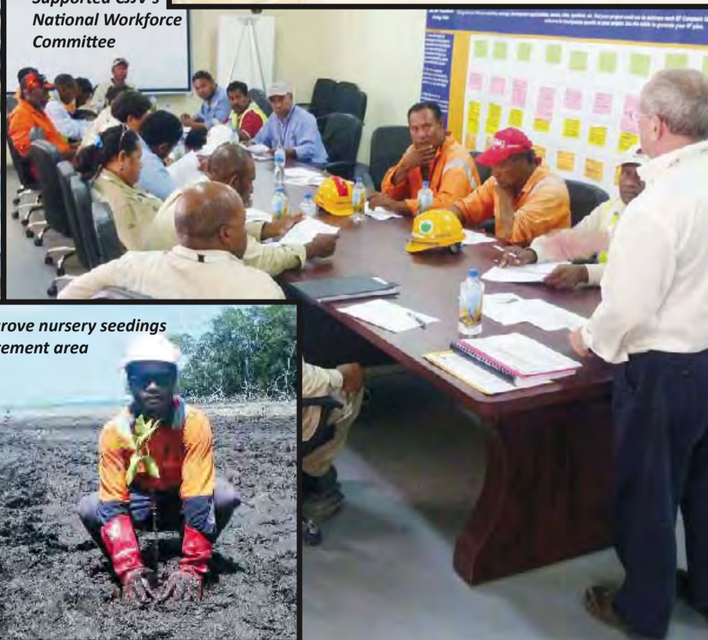
Planted mangrove nursery seedlings in the reinstatement area