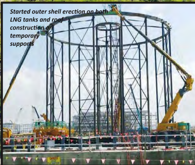
Started outer shell erection on both LNG tanks and roof construction on temporary supports