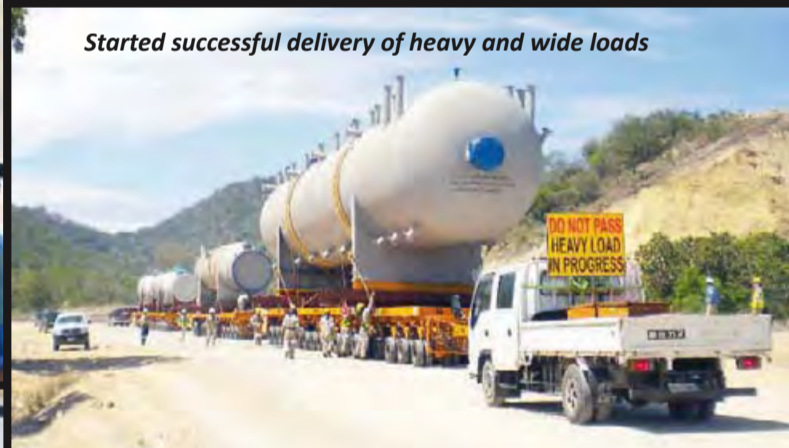
Started successful delivery of heavy and wide loads