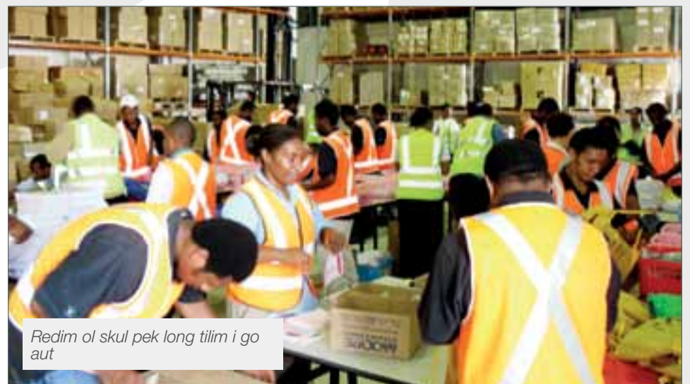
Redim ol skul pek long tilim i go aut

Luksave olsem agrikalsa em i wanpela bikpela samting insait long laip na sindaun bilong ol rural komyuniti long Papua Niugini, Projek i sapotim developmen bilong ol agrikalsa wok long ples, wantaim ol projek i go het pinis long Hides, Omati na long LNG Plent Sait. Ol dispela wok program i lukluk long promotim ekonomik developmen insait long ol rurel eria i sapotim ol komyuniti long planim ol fres gaden kaikai, sanapim ol lain diwai kesyu na halivim ol meri insait long Kikori eria long kamapim wanpela kampani bilong saplain ol kago olsem ol sidling samting.