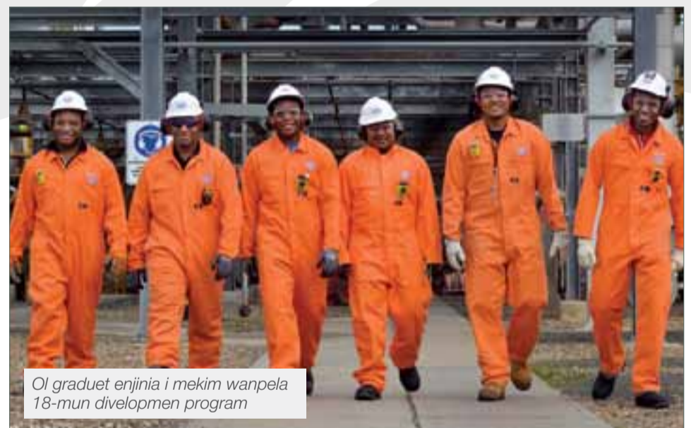
Ol graduet enjinia i mekim wanpela 18-mun developmen program

Projek wok igat nid bilong ol kwolifait konstraksen wokman na strongim sans bilong wok bilong ol Papua Niugini manmeri taim em i givim ol trening ples long sampela ol ples insait long kantri. I kam inap nau, Projek na ol kontrak kampani bilong em i givim pinis moa long 80 kos i gat moa long 1,500 sesen, we moa long 5,000 PNG wokmanmeri i sindaun long em.