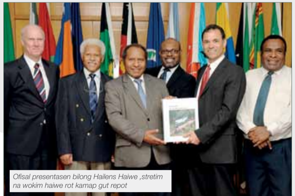
Ofisal presentasen bilong Hailans Haiwe, stretim na wokim haiwe rot kamap gut repot

Projek i go het long wokbung wantaim ol Gavman ejensi olsem Dipatmen bilong Woks, bai ol i ken stretim wokabout bilong kago na masin bilong wok konstraksen. Olsem, Hailans Haiwe em i bikpela samting i mas stap gut bilong karim ol pipel na kago i go kam namel long Hailans rijen na nambis, wantaim tu ol kago na pipel bilong Projek.