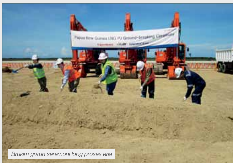
Brukim graun seremoni long proses eria

Papua Niugini Likwifait Netserol Ges (PNG LNG) Projek (Projek) i makim tupela bikpela wok kamap insait long namba wan kwata bilong 2011 wantaim wanpela brukim graun seremoni bilong wok konstraksen long ol proses tren na namba wan simen faundesen ol i kapsaitim long LNG Plent, we bai wanpela bikpela Projek fasiliti o ples wok.