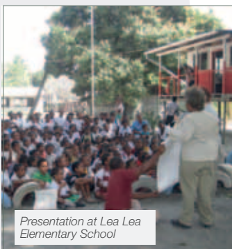
Presentation at Lea Lea Elementary School

Providing a cohesive and considered approach to community investments that ensures resources are allocated efficiently, effectively and equitably is a priority. In September, the Project established a Community Investment and Contributions (CIC) Committee and Working Group to provide internal coordination, strategic oversight and approval of Project-funded community support activities.