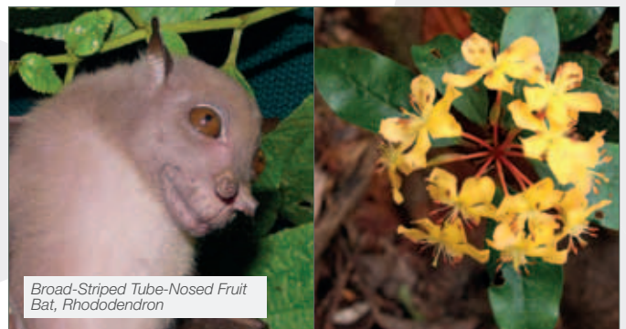
Broad-Striped Tube-Nosed Fruit Bat, Rhododendron

Project Field Environmental Advisors have been stationed at Kopi, Gobe, the LNG plant site, and Hides. They are providing reports summarizing verification activities, which replace verification visits in these locations.