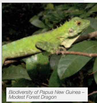
Biodiversity of Papua New Guinea – Modest Forest Dragon

Another significant activity during this quarter was the release of the first report issued by the Independent Environmental and Social Consultant (IESC) following their site visit in May, 2010. The IESC is an independent auditor group working on behalf of the Lender Group. The purpose of the visit was to monitor compliance with Project environmental and social commitments made during Project development. The IESC recognized the Project's commitment to avoiding adverse social, environmental, health and safety impacts that could be caused by Project activities. Non-conformances were reported in relation to the milestone schedule, waste management and resettlement. The Project is using these findings to identify appropriate actions.