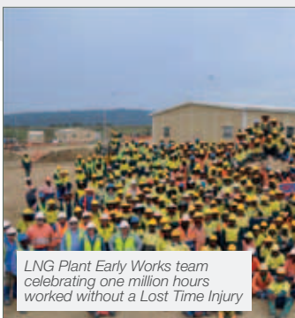
LNG Plant Early Works team celebrating one million hours worked without a Lost Time Injury

In support of the Project's Safety Vision – "Nobody Gets Hurt" – a key focus during the third quarter was gathering lessons learned from early works activities to date and sharing them with contractors preparing to mobilize. Safety alerts, improved hazard identification, a better understanding of risks specific to working in Papua New Guinea, and more effective communication about hazards and mitigation measures all contributed to a downward trend in incidents.