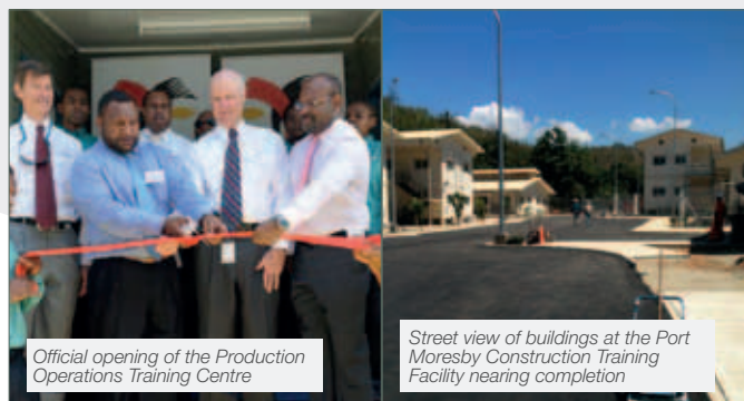
Official opening of the Production Operations Training Centre

A significant training milestone this quarter was the official opening of the Production Operations Training Centre in Waigani, Port Moresby in September. The Centre will train Papua New Guinean operations and maintenance technicians who will be recruited over the next two years for work in the LNG plant site operating facilities after Project completion and commissioning.