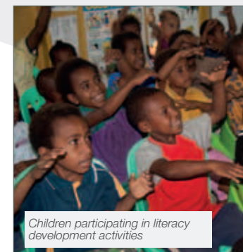
Children participating in literacy development activities

In the Hides and Komo areas, a Traffic and Construction Site Safety Awareness Program was implemented focusing on schools, churches, local communities and Project drivers. Direct engagement, drama skits, and fun children's games with a safety message supplemented posters and flyers.