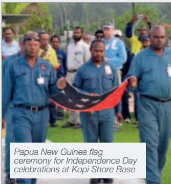
Papua New Guinea flag ceremony for Independence Day celebrations at Kopi Shore Base

The Project is investing and participating in a broad range of initiatives to promote economic growth and create positive, sustainable impacts in areas including health, education, agriculture, local economic development, women's economic empowerment, and capacity building of individuals and community institutions.