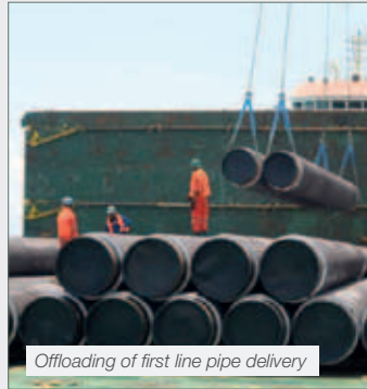
Offloading of first line pipe delivery

Third quarter construction activities continued to focus on improving and upgrading infrastructure including roads and bridgeworks, telecommunications and the installation of pioneer and construction camps. A major milestone was the completion of two wharves at Kopi that will be used to receive the line pipe for the construction of the gas and condensate pipelines. In addition, the first load of finished line pipe arrived in Port Moresby in September.