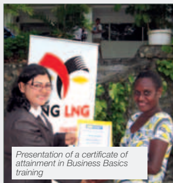
Presentation of a certificate of attainment in Business Basics training

As part of the Project's support for empowering women to drive positive economic change in their communities, a number of Papua New Guinean women were sponsored to attend the Australian Women in Agriculture's annual meeting in August. This event allows female farmers to share lessons learned, best practices, and network with peers. In September, along with partner organization the Papua New Guinea Chamber of Mines, the Project began a skills development needs assessment, as a precursor to launching a training program for women in communities around the LNG plant site, including Porebada, Boera, Papa and Lea Lea.