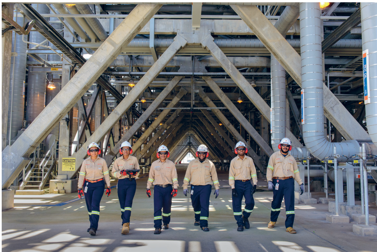
Newly recruited engineers at the LNG Plant

EMPNG participated in the 39 th International Association for Impact Assessment conference in Brisbane, Australia during 2019. EMPNG workers and consultants delivered 11 presentations and chaired three sessions. EMPNG also sponsored 15 Papua New Guinean environment and conservation professionals from government, academia and non-governmental agencies to attend the conference.