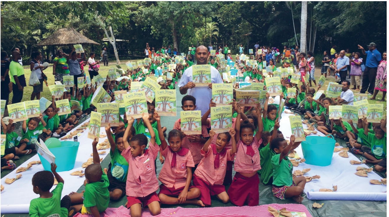
National Literacy Week activities at the Port Moresby Nature Park

Over the past decade, PNG LNG has worked with locally based stakeholders to improve educational facilities for Papua New Guinean students, from elementary school through to university. This has included the construction of multiple school facilities, the provision of university scholarships and the development of structured school programs, such as the Science Ambassador Program that encourages primary and high school students to consider careers in science, technology, engineering and mathematics through interactive educational activities. More than 5000 students have participated in the Science Ambassador Program during almost 90 classroom visits across Upstream area, LNG Plant site villages and Port Moresby schools since it was introduced to Papua New Guinea in 2013.