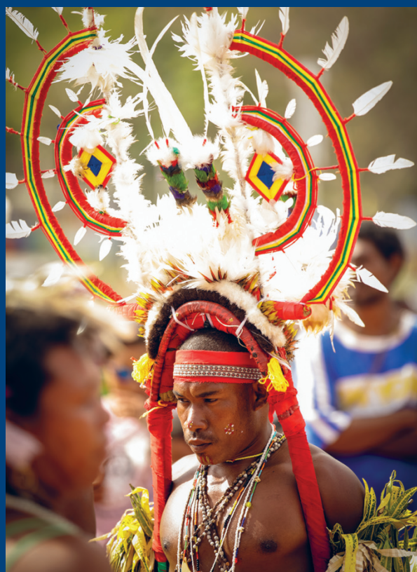
Performer in traditional costume at the 2019 Hiri Moale Festival

EMPNG has sponsored the Hiri Moale Festival for the sixth consecutive year with a PGK67,000 (US$19,660) donation in 2019. The Festival included the Motu Koita Music Festival and Vanagi (canoe) race.