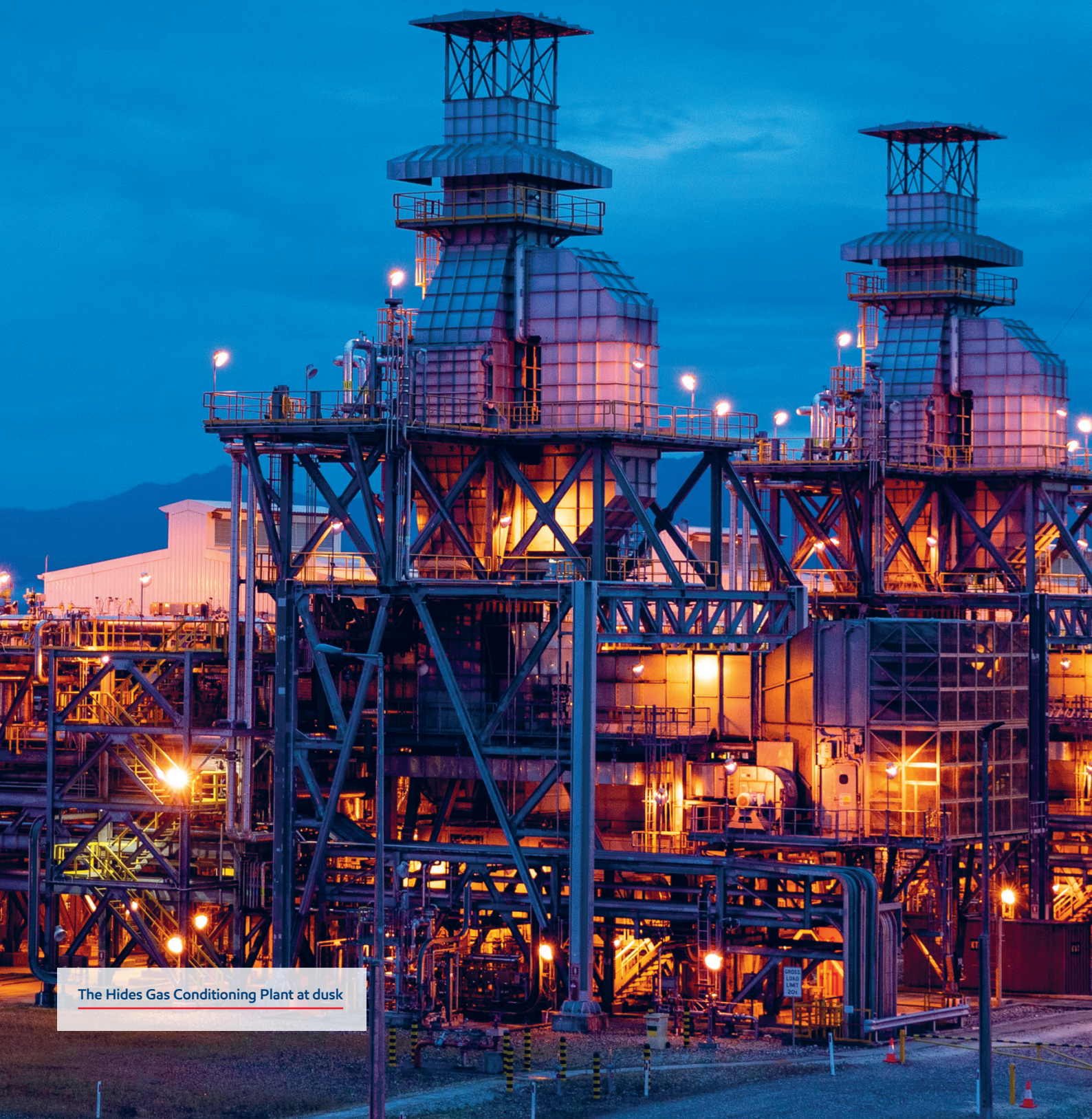
The Hides Gas Conditioning Plant at dusk

ExxonMobil PNG Limited has just completed 10 years of creating and growing a significant economic opportunity for Papua New Guinea.