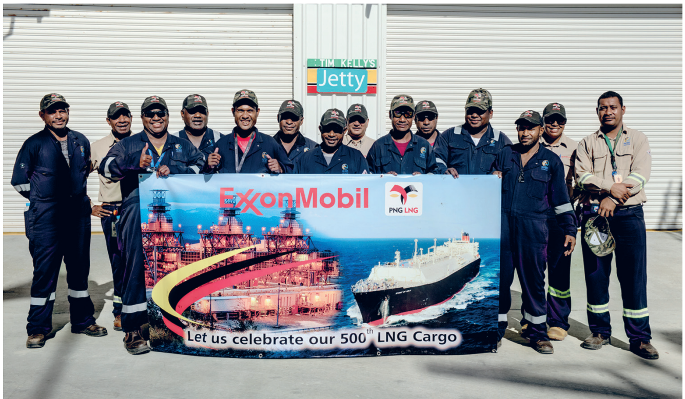
Workers celebrate the 500 th LNG cargo at the LNG Plant Marine Terminal

In 2019, EMPNG's Medicine and Occupational Health team was recognised with an ExxonMobil Global Health and Safety Award for the second consecutive year.