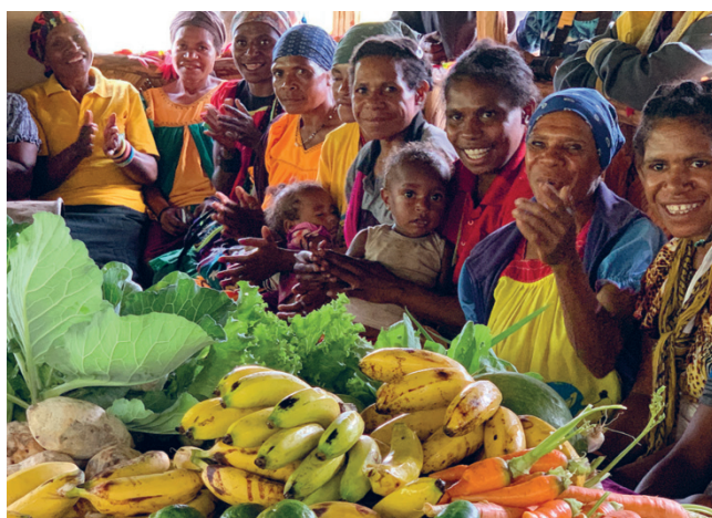
Members of the Mbelopa Women's Group preparing for a fresh produce market day

In the Upstream area, engagements focused on community development activities such as fresh produce market days, community events and celebrations including Independence Day. At the LNG Plant site villages, engagements included marine, road and pedestrian safety education sessions with communities and schools.