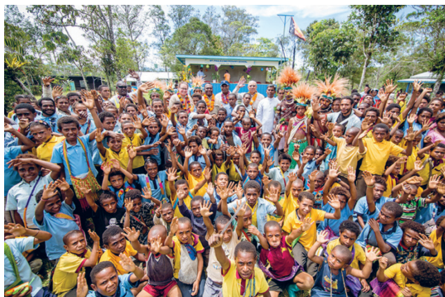
Students and teachers celebrate the handover of a new teacher's house at St. Paul's Primary School in Komo

EMPNG's support for schools, in partnership with provincial government authorities, in 2019 included: two new staff houses, a double classroom and sanitation facilities for Para Primary School; a new staff house and sanitation facilities for St. Paul's Primary School in Komo; and sanitation facilities for Redscar High School and Boera, Lea Lea and Papa primary schools.