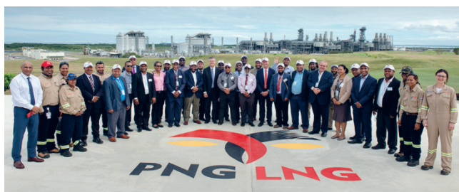
Lancos and EMPNG workers celebrate 10 years of partnership

In 2019, EMPNG celebrated a decade of working together with HGDC, Laba Holdings Limited and Trans Wonderland Limited.