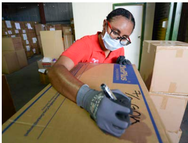
EMPNG employees support the National Department of Health with preparing personal protective equipment packages for frontline health workers as part of pandemic response efforts

To support Papua New Guinea's pandemic response, EMPNG donated medical equipment to the National Department of Health. The equipment was used to establish an infectious disease isolation facility at Port Moresby General Hospital. EMPNG volunteers helped distribute the medical equipment and personal protective equipment to hospitals and frontline health workers during the year. EMPNG also provided food donations for frontline health workers and health facilities.