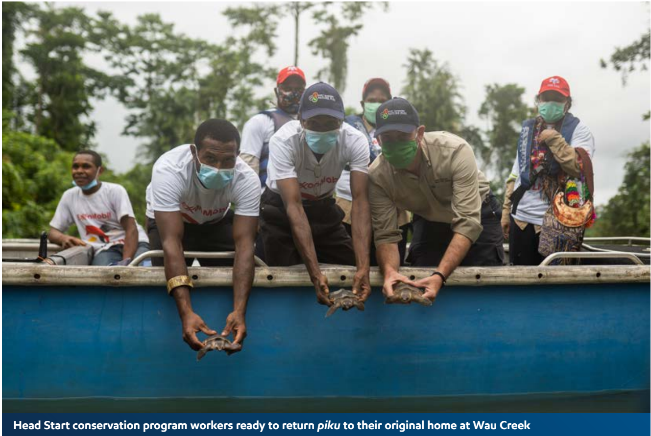
Head Start conservation program workers ready to return piku to their original home at Wau Creek

During 2020, EMPNG and Buk bilong Pikinini launched an early childhood development app, which will be used by Buk bilong Pikinini's library learning centres to help teachers use technology to support children's learning.