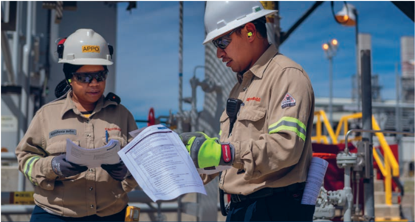
LNG Plent Operesens Kompetensi Asurens Stended asesas, Appolonia Nabo na Moale Bae

Long pinis bilong 2020, PNG LNG wokfos em 2784 wokmanmeri wantaim ol kontrakta. Dispela namba i bin kam daun long 3964 long pinis bilong 2019 bihain long wok i bin stop long sampela Apstrim eria projek bikos long travel na wok ples restriksen kamap bikos long COVID-19. Dispela namba bilong wokfos long 2020 i bin gat 2539 sitisen bilong Papua Niugini, husat i makim 91 pesen bilong wokfos, we long 2019, dispela mak i bin stap long 86 pesen. Namel long ol Papua Niugini wokfos, 20 pesen em ol meri, we long 2019, dispela mak i bin stap long 17 pesen. I gat tenpela nupela Papua Niugini ensinia long prodaksen operesens long 2020 wantaim namba tu intek bilong ol greduet ensinia.