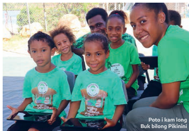
Buk bilong Pikinini i kamapim nupela app bilong lainim ol pikinini

EMPNG i wok long sapotim yet Buk bilong Pikinini long wok bilong en long skulim moa pikinini long rit, long taim em i kirapim ol komyuniti laibreri na givim ol pikinini buk bilong rit.