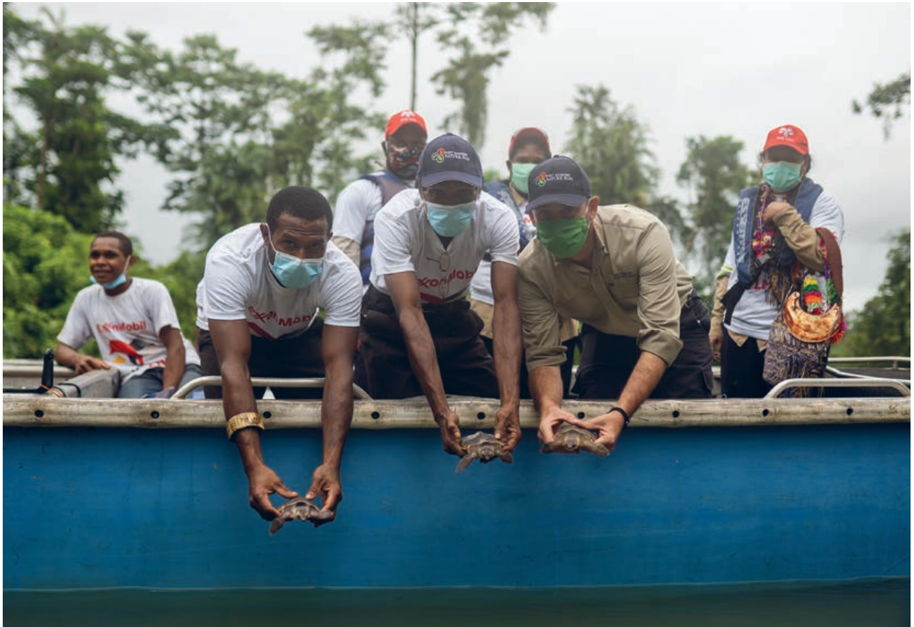
Ol woklain bilong Head Start konsevesen program i putim ol piku i go bek long asples bilong ol long Wau Creek