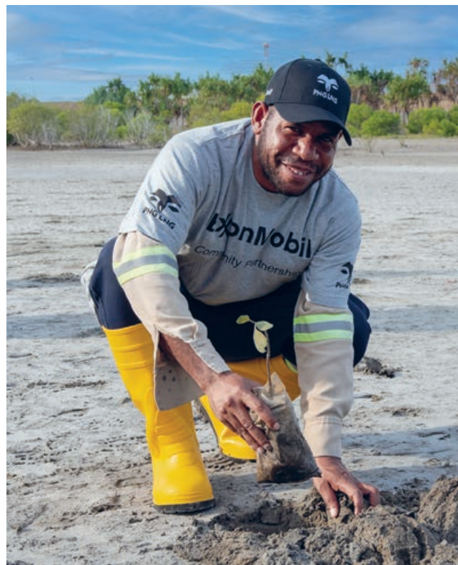
LNG Plent Kemp Fasilitis Kodineta, Bart Kasen i givim taim bilong em long planim ol mangro diwai klostu long LNG Plent sait

Long sapotim baiodaivesiti ristoiresen komitmen bilong EMPNG long 'Protektim Tumora. Tude', ol 57 volantia long LNG Plent sait i bin planim ol mangro diwai klostu long LNG Plent sait long Julai.