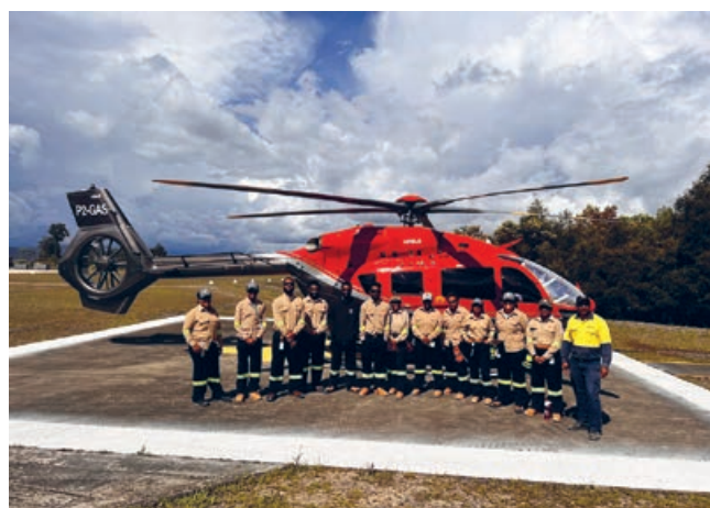
Graduate Management Development Program participants arrive at the Upstream area for a tour of facilities

The Graduate Management Development Program selects graduates from across multiple subject disciplines and rotates them through different departments over a three-year period to obtain a broad understanding of EMPNG's business. EMPNG currently has 15 workers who are part of the Graduate Management Development Program and four who have graduated from the Program.