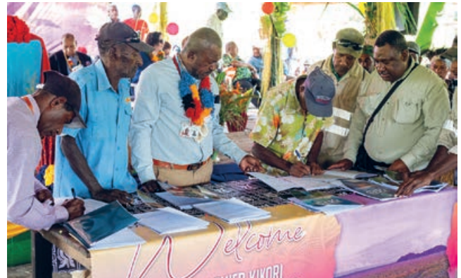
Signing of community conservation deeds at Kikori Station

In addition to community-based conservation, EMPNG consistently works to improve its environmental management processes. This includes ongoing waste management initiatives that are being implemented to improve long-term waste management solutions at all EMPNG worksites.