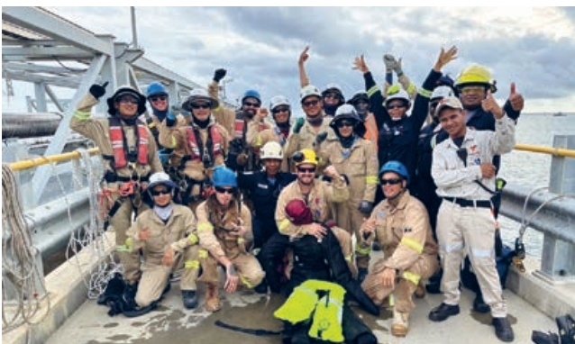
Responders celebrate the successful completion of the annual marine weather drill at the LNG Plant Marine Terminal

In accordance with ExxonMobil Emergency Preparedness and Response guidelines, all 22 EMPNG Tactical Response Plans were reviewed and updated in 2023 to match the corporate standard. This global standard helps provide clarity around responses to critical first hours activities and provides consistency across business units to optimise EMPNG's emergency response.