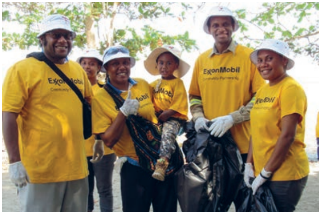
EMPNG workers and their families volunteer to clean up Lea Lea beachfront

The Science Ambassador Program is among numerous community-based activities that received some 400 hours of volunteer support from more than 320 EMPNG workers during the year. About 180 volunteers participated in activities organised by the Employee Resource Group from ExxonMobil Haus in Port Moresby, and over 140 volunteers participated in support activities in communities near the LNG Plant, HGCP, Moro, and Angore facilities.