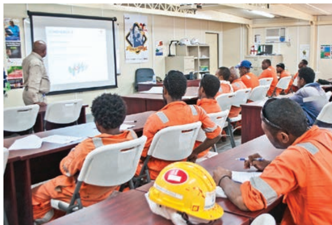
Trensens trening i givim save long ol woka long helpim ol i painim narapela wok bihain long ol i lusim Projek

Ol i yusim tu drama long toksave long wanem ol samting ol Lenona Kampani (Lancos) i mas bihainim long taim ol wokmanmeri bilong ol i pinis wok na wanem samting ol dispela woka i ken mekim long redi long taim olgeta wok i pinis na ol tu i mas go nabaut.