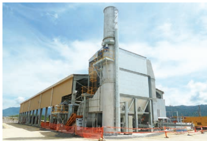
Hides Weist Manesmen Fasiliti em bikpela ples bilong rausim ol pipia

Pasin bilong ol kontrakta long lukautim na rausim gut ol pipia i wok long kamap gut nau insait long ol Projek sait. Dispela samting i kamap bikos ol i serim eksperiens bilong ol na tu, ol i bihainim nupela pasin bilong yusim gen ol pipia na risaikel, olsem dispela peten Ecoflex system. Em i save brukim ol olpela taia i go liklik long putim long rot, na banisim ples we graun i bruk na ol i yusim long sanapim riteining wol. I tru olsem Projek i laik yusim gen ol samting, o risaikel na katim daun namba bilong ol pipia, tasol sampela pipia em ol i no inap yusim gen. Long ol dispela kain pipia, Hides Weist Manesmen Fasiliti i mekim bikpela wok tru long stretim ol pipia we i no gat narapela rot bilong risaikel gen. Ol i olim dispela kain pipia ol non-risaiklabel weist. Long dispela kwata, Projek i stat long kisim ol non-risaiklabel weist long ples we ol bin bungim i stap, na salim i go long Hides Fasiliti long rausim. I kam inap nau, ol i bin salim 75 ton bilong ol dispela kain pipia i go long dispela Fasiliti.