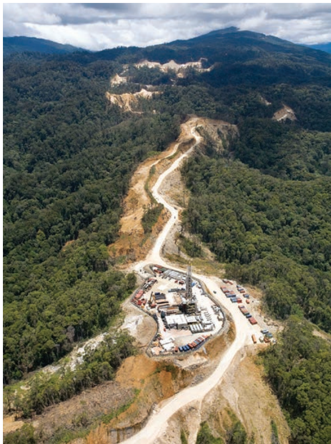
Wok bilong drilim wel long namba wan bilong ol eitpela prodaksen wel i pinis long Welped B