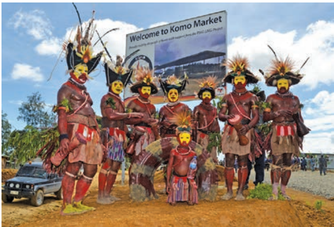
Ol lain i wokim singsing tumbuna long taim bilong opim Komo komyuniti maket

Ol pipel bilong Komo viles i lukim kaikai bilong nupela komyuniti maket bilong ol arere long nupela Bank South Pacific (BSP) brens, em ol i opim tupela wantaim long Jun 9.