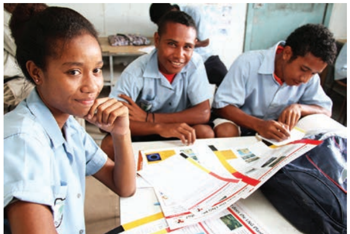
Science Ambassador Program na ol materiel bilong skulim saiens long Redscar High School

Insait long dispela Program, ol i yusim ol saiens kit long helpim ol studen i amamas wantaim long kisim skul long saiens na petrokemikel indastri.