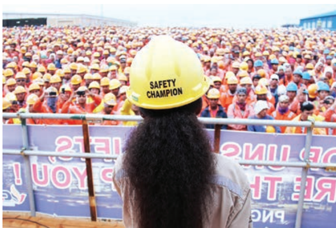
IIF® bung bin kamap long LNG Plent sait

Hides Eria Trefik Sefti Komiti i laikim tupela komyuniti developmen inisitiv long helpim ol manmeri husat i wokabaut long rot i ken kalapim gut wanpela bisi rotbung klostu long rot i go insait long Hides Ges Kondisening Plent sait. Dispela wok i kamapim wanpela ples bilong wokabaut na ol banis bilong stopim ol pipel na ol ka, na bai stopim ol pikinini long wokabaut long rot bilong ka.