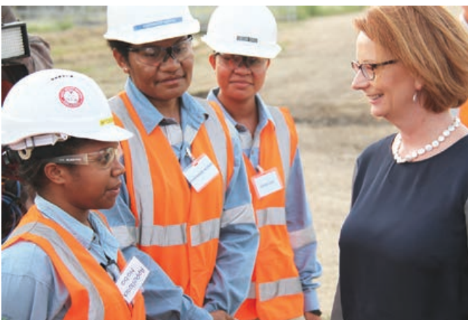
Julia Gillard, olpela Prait Minista bilong Australia, i toktok wantaim ol Operesen na Mentenens treni

Long taim em i wokbung wantaim ol komyuniti, gavman, ol Papua Niugini saplaia na ol arapela ki stekholda, Projek i gohet yet long winim mak long planti ol wok bilong en.