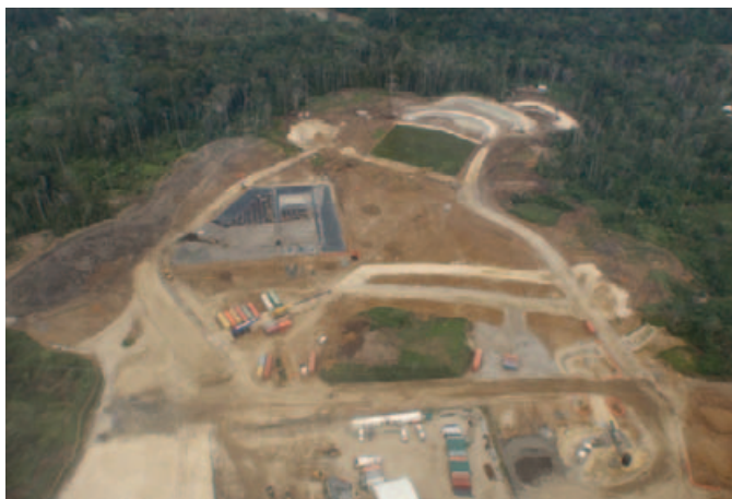
Hides Waste Management Facility construction progress

Advances were also made following a Project-wide waste management review completed in the first quarter 2011. Construction of the Hides Waste Management Facility is progressing well with the installation of the lined landfill, a wetland filter for the leachate treatment facility and facility roads completed.