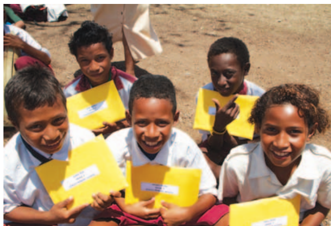
Kastom Stori 'Top 5' entrants from Grade 3 at Lea Lea Primary School

Judging of the Kastom Stori/Sene Gori competition, launched in the first quarter 2011, was a particular highlight of this quarter. The competition invited students from schools across the Project area to submit stories and artwork that reflect Papua New Guinea's cultural heritage. A total of 3,700 stories and pictures were submitted.