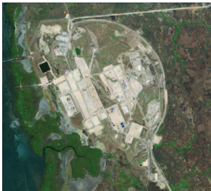
Aerial view of the LNG plant site

With all major contractors now active in Papua New Guinea, construction is advancing at the Liquefied Natural Gas (LNG) plant site, along the pipeline route and in the Highlands region. Good progress is being made towards the 2014 start-up window. A major milestone achieved this quarter was the delivery of the final line pipe sections to Kopi Shore Base, with 40,000 sections of pipe for the 292-kilometre main onshore pipeline successfully transported and offloaded without a single safety incident.