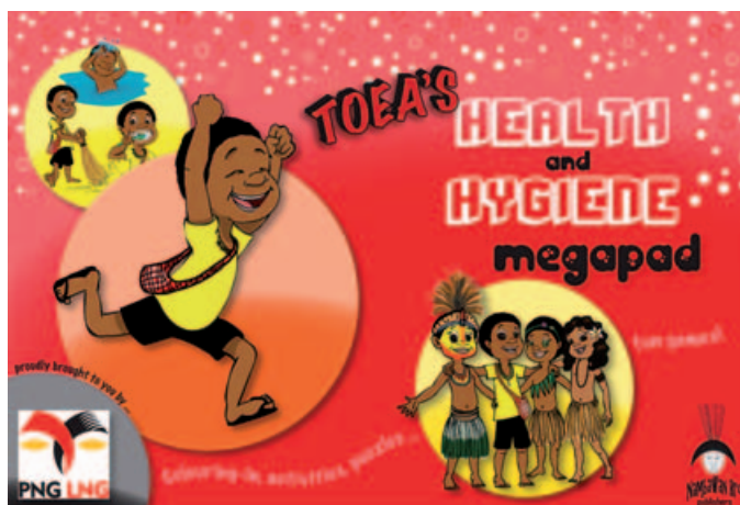
Second book in the Toea Project Interface series – Toea's Health and Hygiene Megapad

Meanwhile, the third series of Toea books, called Toea's Hiri Adventure, was completed, along with the second Toea Project Interface children's book focused on health and hygiene. The health and hygiene activity book contains songs, educational games, coloring-in and key health messages for children.