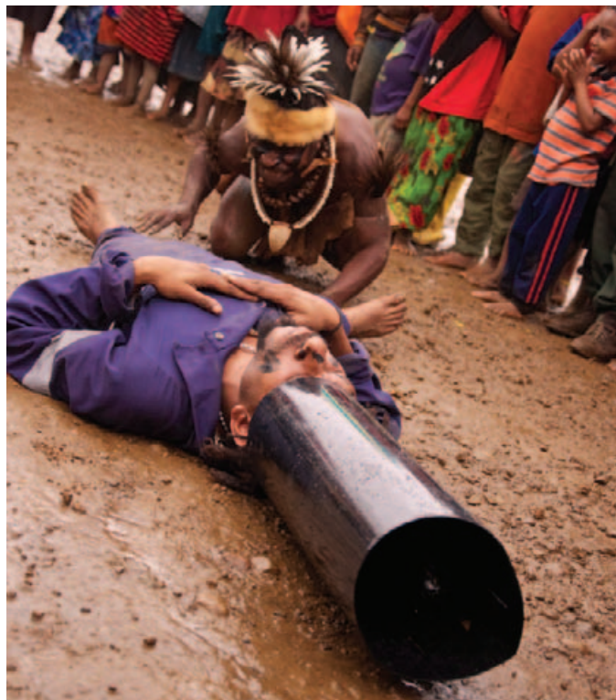
Communicating safety and other messages through the play Laif Bilong Ba'amo, Ges Paiplain (The Life of Ba'amo, the Gas Pipeline)

22 drama performances held in 25 communities with more than 3,000 viewers