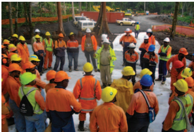
Toolbox talks communicate job hazards and required safe practices

A Project-funded Safety Champions initiative commenced in September. This initiative provides selected Papua New Guinean workers with additional training and experience so they may positively influence safety in the workplace. Almost 200 candidates were nominated based on their ability to positively influence peers and model good behavior from within the workforce. Initiatives such as this reinforce core safety processes and ensure safety is a central component of the workplace culture.