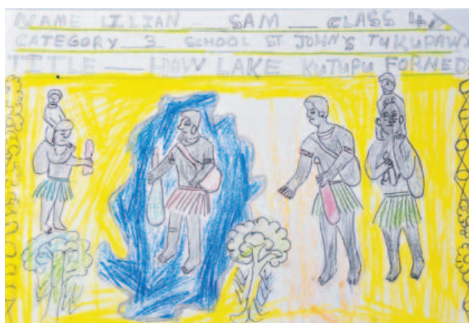
A Kastom Stori artwork entry

Meanwhile, the third series of Toea books, called Toea's Hiri Adventure, was completed, along with the second Toea Project Interface children's book focused on health and hygiene. The health and hygiene activity book contains songs, educational games, coloring-in and key health messages for children.