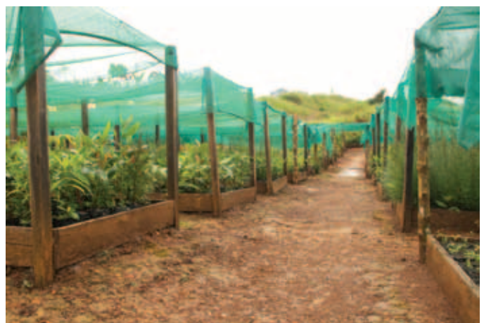
Hundreds of indigenous plants being grown at the Komo nursery for reinstatement works