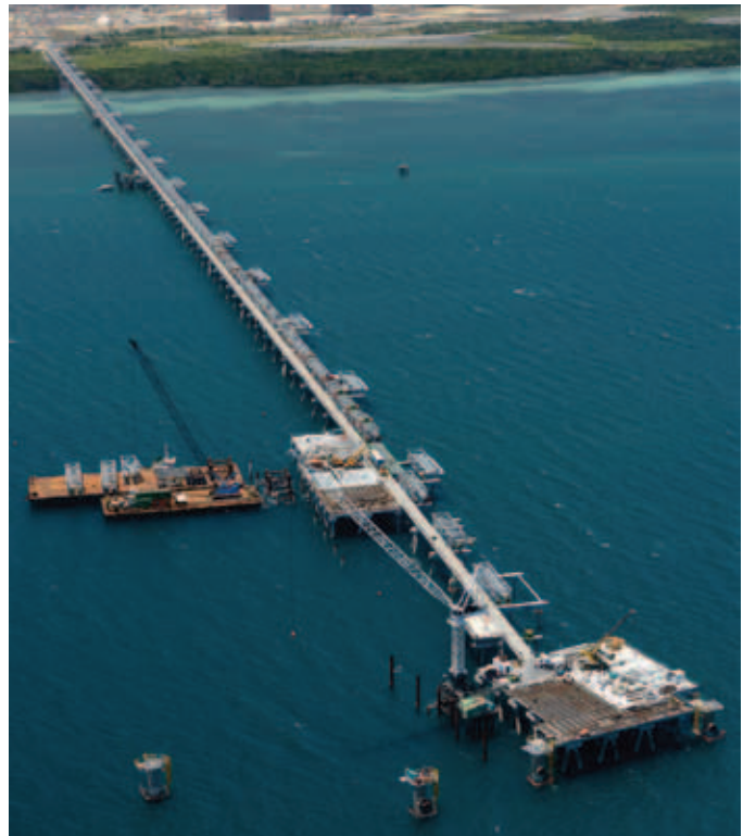
All 120 pipe rack modules now installed on the LNG jetty