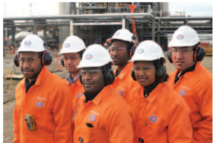
Six of the Papua New Guinean graduate engineers from the second group at Long Island Point

The training provided to Papua New Guinean citizens not only prepares them for roles within the Project but also provides the skills and qualifications for other domestic and international opportunities.