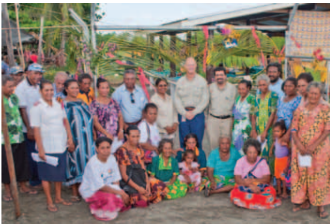
Official opening of the Lea Lea community market

Reinstatement works continue to progress across Project work sites. This includes planting of locally sourced stock and spreading of Japanese Millet and Carpet Grass seeds at the HGCP site, as well as reinstatement activities in the LNG plant site area and along the onshore pipeline Right of Way.