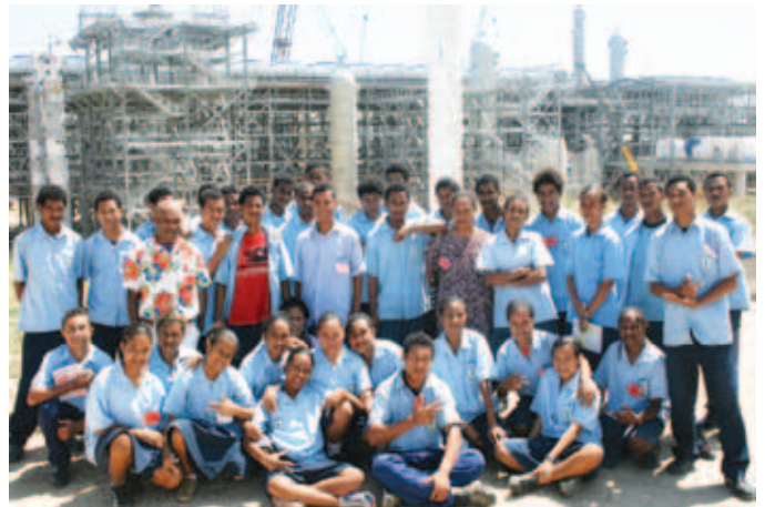
Redscar High School students receive an important lesson in safety at the LNG plant site

During this quarter, the Project continued its support of medical research projects that have the potential to deliver long-term benefits to Papua New Guinean communities. For example, the Project is funding tuberculosis research at Kikori Hospital in the Gulf Province conducted through the Papua New Guinea Institute of Medical Research (IMR). Findings from this research are anticipated to significantly benefit public health in the Gulf Province and the overall tuberculosis control program in Papua New Guinea.