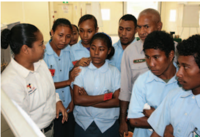
Ol Redscar High School studen i redi long statim lukluk raun long LNG plent sait

Namba bilong ol pipel husat i bin go lukluk raun long kisim save long wanem samting i kamap insait long LNG plent sait long dispela kwata em 290 visita husat i kam long ol skul, komyuniti ogenaísesen na Gavman. Dispela lukluk raun i givim save long ol skul studen na lokal komyuniti long wanem konstraksen wok i kamap na i strongim toktok bilong helt na sefti tu. Wantaim ol lukluk raun long sait, Projek i sapotim tu ol skul helt na sefti edukesen progrem.