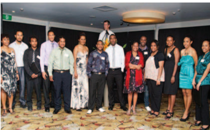
Namba wan lain greduet bilong Operesens na Mentanens grup bilong Projek long greduesen seremoni long Papua Niugini

Namel long ol lain husat i bin kisim trening, em namba wan lain husat i stap insait long Operesens na Mentanens trening progrem. Ol i kam bek long Papua Niugini long dispela kwata bihain long ol i pinisim wanpela yia Advens Skils trening long Nova Scotia, Canada. Dispela lain i wokim trening-long-pleswok we ol bai redi long mekim ol wok insait long operesens bilong Projek.