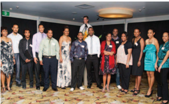
Graduates from the Project's first intake of Operations and Maintenance trainees at the graduation ceremony in Papua New Guinea

Among the trainees is the first intake of participants in the Operations and Maintenance training program, who returned to Papua New Guinea this quarter after successfully completing one year of Advanced Skills training in Nova Scotia, Canada. The group is now involved in on-the-job training to prepare for their future Project operations roles.