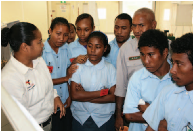
Redscar High School students receive an important lesson in safety at the LNG plant site

Educational site tours continue at the LNG plant site, with around 290 visitors from schools, community organizations and Government participating in site tours during this quarter. These visits help educate school students and local communities about construction activities and reinforce health and safety messages. In addition to site tours, the Project supports school health and safety education programs.