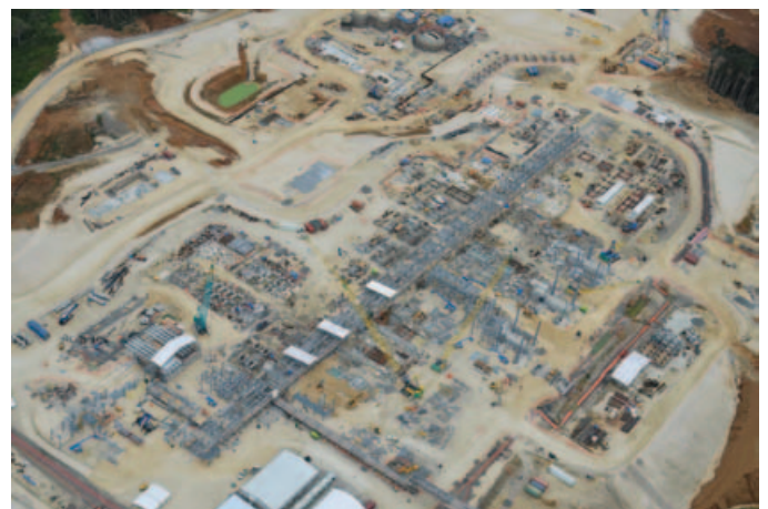
Aerial view of the Hides Gas Conditioning Plant

Key construction highlights are outlined in Table 1.