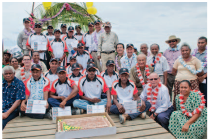
Project representatives, volunteers and members of the community at the Lea Lea Bridge opening ceremony

Progress was also made on a community-led Agricultural Development Plan, which incorporates a support program to provide training on enhanced farming techniques, planting materials and tools. It also provides ongoing support to participants in the LNG plant site villages.