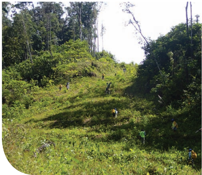
Regeneration monitoring takes place.

and as a result reinstatement took place once construction was complete. This was achieved by establishing stable landforms and creating ground conditions that continue to help the regrowth of natural and native vegetation in the areas. Early observations during preparatory work for the first regeneration monitoring show that ROW regeneration is going well, with good vegetation cover by a range of desirable forest plant species. Through the Environmental Management Plan, EMPNG will continue to ensure we protect Papua New Guinea's pristine natural environment for future generations.