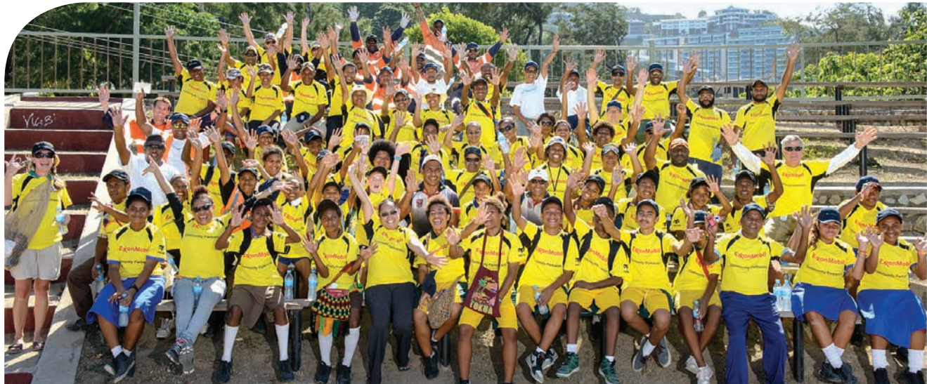
World Environment Day volunteers at Ela Beach, Port Moresby and Para Community Primary School in Hela Province.