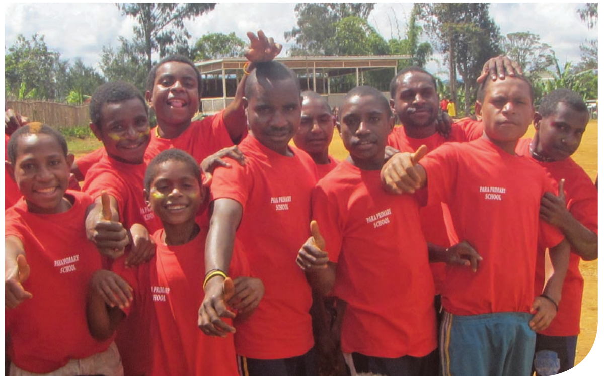
Students in their new sports uniforms.