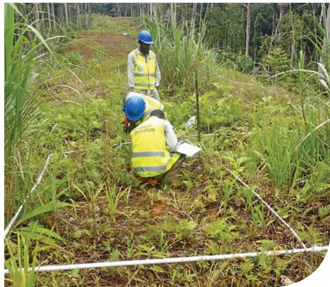
Good vegetation cover is being established by a range of desirable forest plant species.