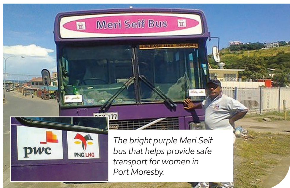
The bright purple Meri Seif bus that helps provide safe transport for women in Port Moresby.