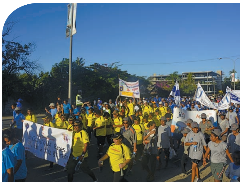
EMPNG staff with participants during the Sir Anthony Siaguru Walk Against Corruption.